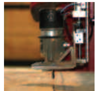
The sky is the limit when it comes to project complexity. Our laser-guided process means your roof trusses are fit precisely to architectural drawings.